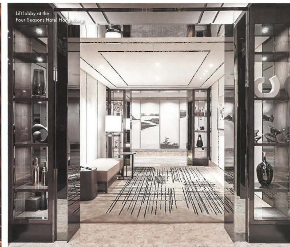
Lift lobby at the Four Seasons Hotel Hong Kong