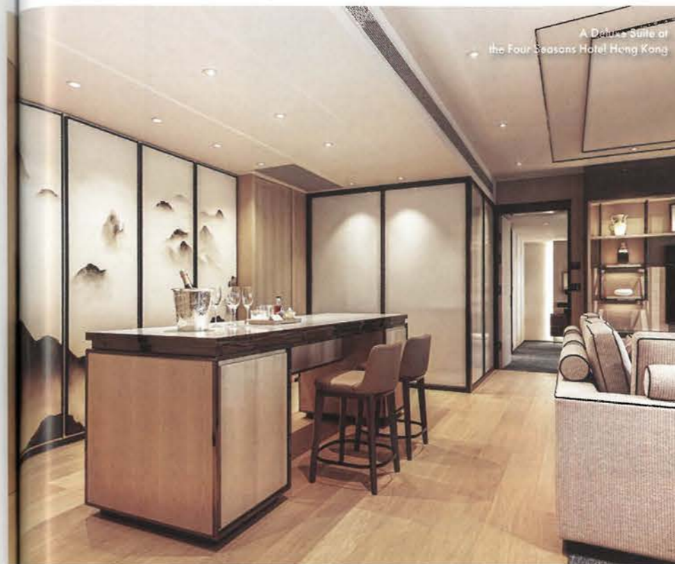
A Deluxe Suite at the Four Seasons Hotel Hong Kong