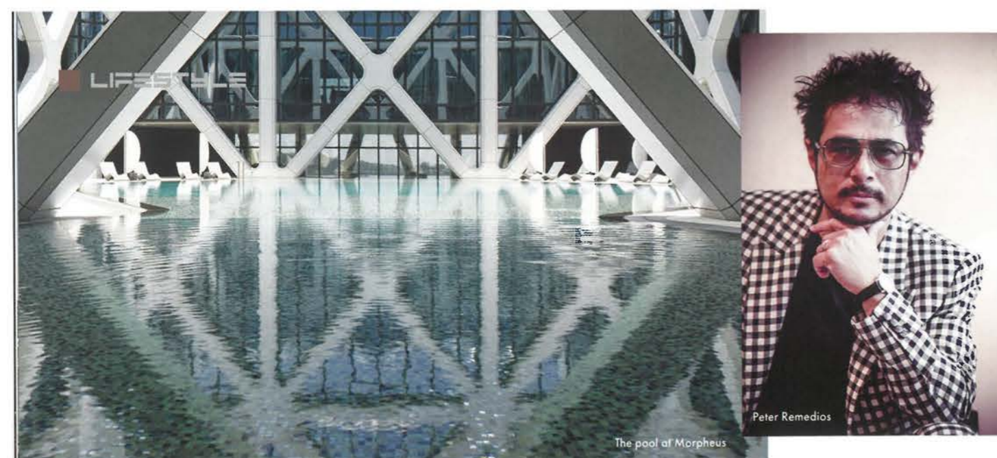
The pool at Morpheus