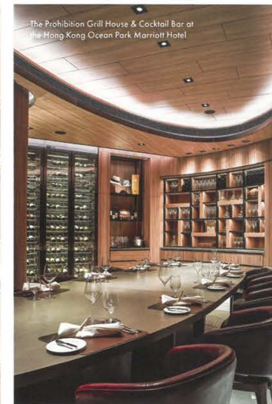
The Prohibition Grill House &amp; Cocktail Bar at the Hong Kong Ocean Park Marriott Hotel